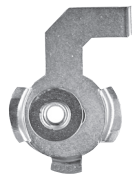
[figure 3] SMALL BRACKET